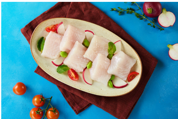
Cube cut from Well-trimmed fillet