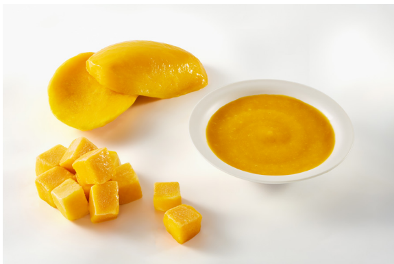
IQF Mango (Cube, Half, Puree) Varierty: Kaew, Taiwan, Catchu