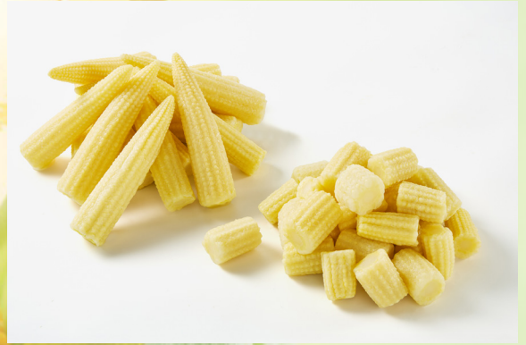
IQF Baby corn (Cut, Whole)