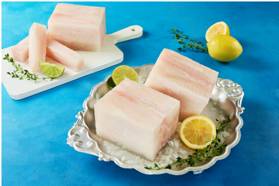
Industrial block - Cube Cut