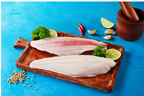
Semi-trimmed fillet, red meat on