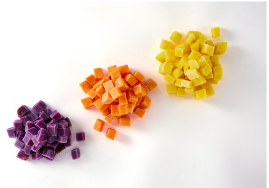
IQF Sweet Potato