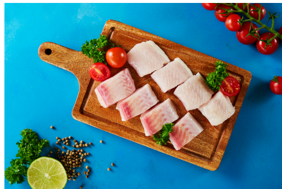
Cube cut from untrimmed fillet