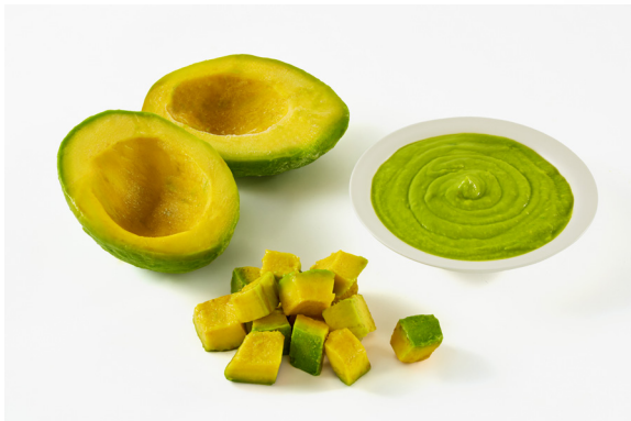
IQF Avocado (dice, half)