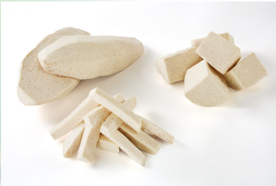
IQF Taro (Half, Dice)