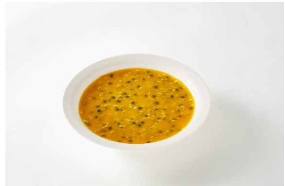
IQF Passion fruit (dice, juice)