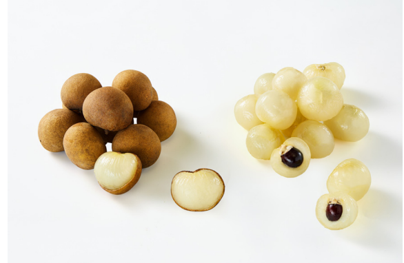
IQF Longan (whole, shell off, seedless)