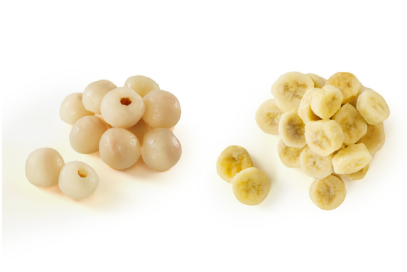
IQF Lychee (remove shell, seedless) + IQF banana