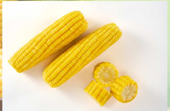
IQF Sweet Corn (Cut, Whole)