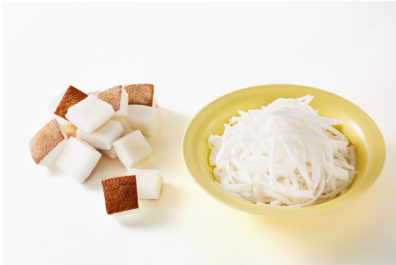
IQF Coconut (shred+ dice)