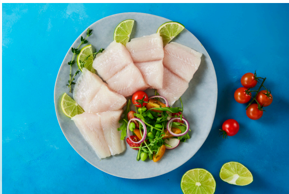
Portion cut from Well-trimmed fillet