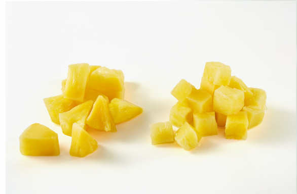
IQF Pineapple (dice, tibat)