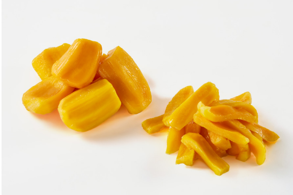
IQF Jackfruit (shred, whole)