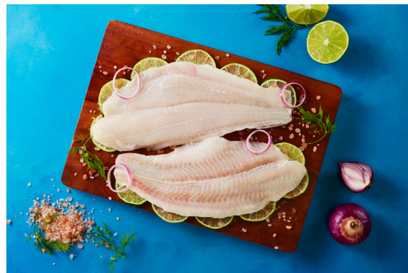
Semi-trimmed fillet, belly on