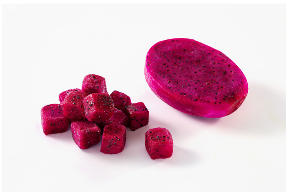
IQF Red Dragon Fruit (dice, half)