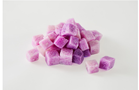
IQF Purple Yam