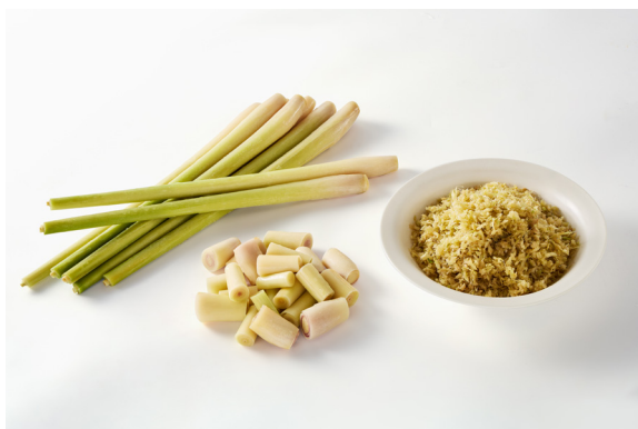
IQF Lemongrass (minced, cut, whole)