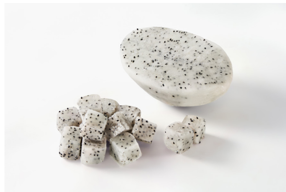
IQF White Dragon Fruit (dice, half)