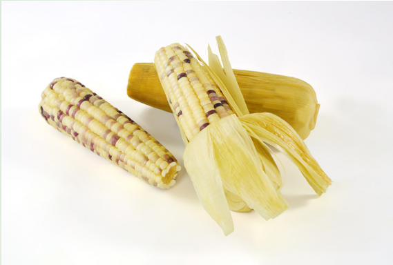
IQF Waxy Corn (Cut, Whole)